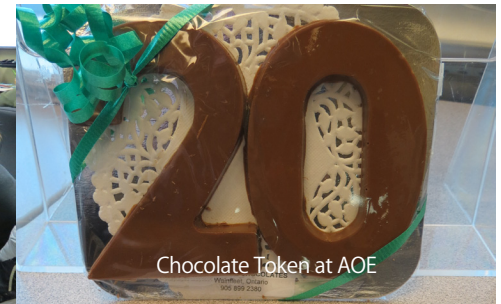
Chocolate Token at AOE