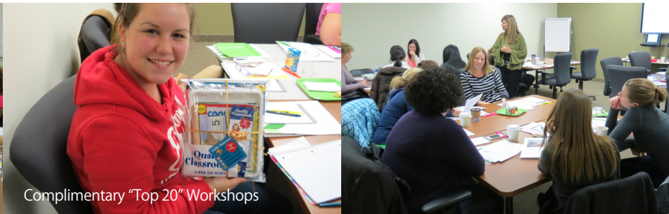
Complimentary "Top 20" Workshops