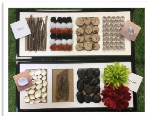
Supporting Children's Sensory Experiences