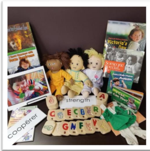
Catalogue ID: BOX.0151.00, #1795

To schedule a pick-up time for resources, please email eccdc@eccdc.org or to purchase visit www.eccdc.org