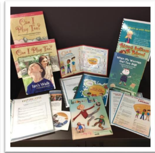
Catalogue ID: PRA.0076.00, #1309