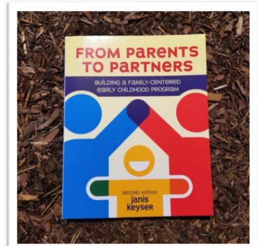
From Parents to Partners: Building a Family-Centered Early Childhood Program