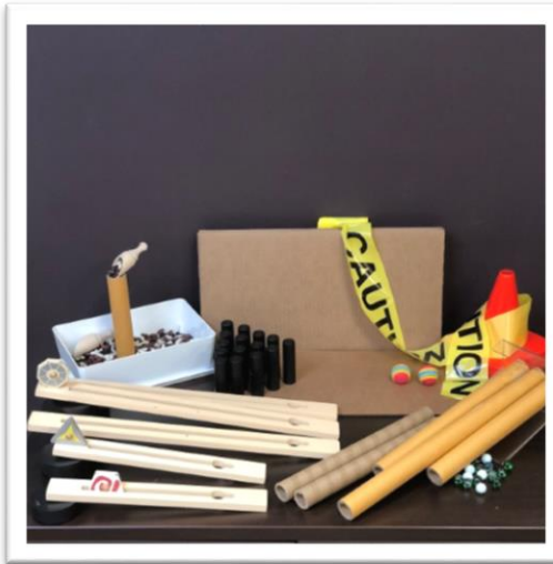
Catalogue ID: BOX.0534.00, #6559 School Ageds Explore Trajectory & Motion With Loose Parts