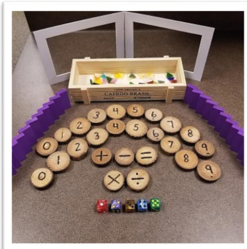
Numeracy Exploration for School Ageds