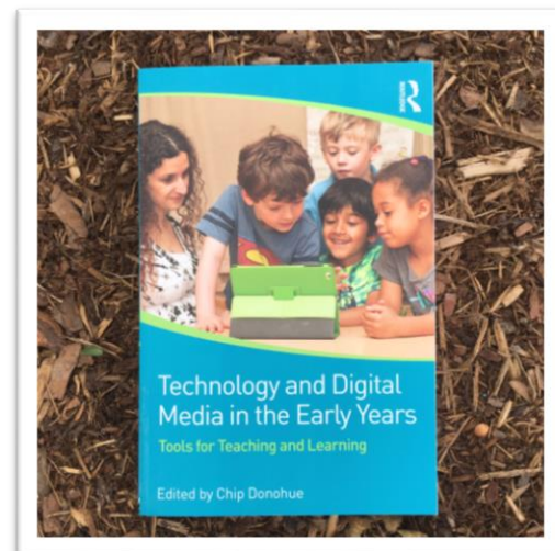
Technology & Digital Media in the Early Years: Tools for Teaching and Learning