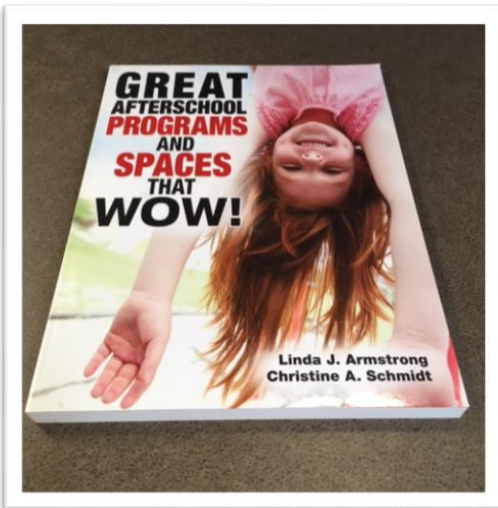
Catalogue ID: SCH.0006.02, #6163

To schedule a pick-up time for resources, please email eccdc@eccdc.org or to purchase visit www.eccdc.org